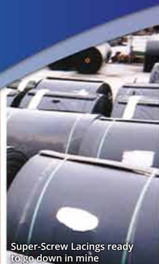
Super-Screw Lacings ready to go down in mine