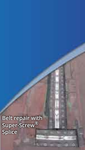
Belt repair with Super-Screw® Splice