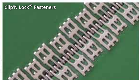
Clip'N Lock® Fasteners