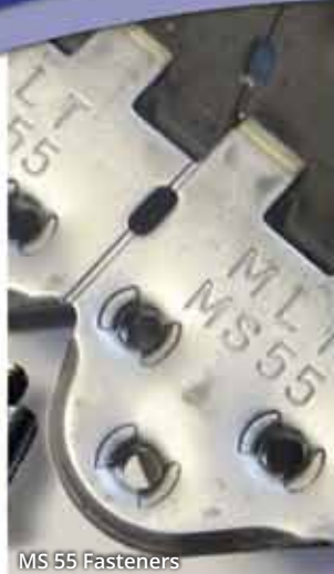
MS 55 Fasteners